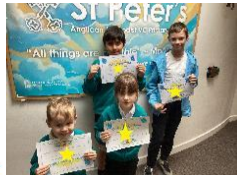
Friday 06 March