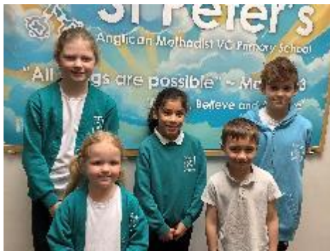
Friday 27 February

Congratulations to these children who received the Star of the Week Award from their class teachers over the first weeks of term. They have been working hard and displaying the right attitudes and values of the school, including being Ready, Respectful and Safe. You can also find their picture on the school's website.