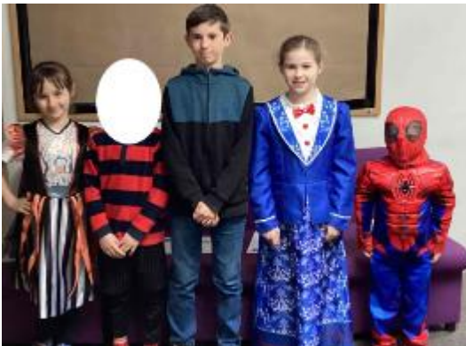
Friday 27 March

Congratulations to these children who received the Star of the Week Award from their class teachers over the last weeks of term. They have been working hard and displaying the right attitudes and values of the school, including being Ready, Respectful and Safe. You can also find their picture on the school's website.