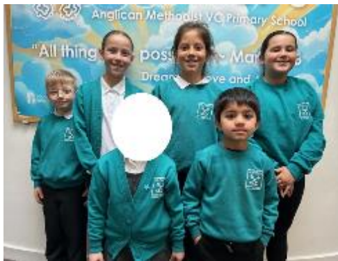
Friday 13 March

Congratulations to these children who received the Star of the Week Award from their class teachers over the first weeks of term. They have been working hard and displaying the right attitudes and values of the school, including being Ready, Respectful and Safe. You can also find their picture on the school's website.