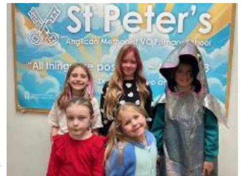
Friday 20 March