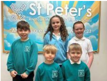
Friday 24 April

Congratulations to these children who received the Star of the Week Award from their class teachers over the last weeks of term. They have been working hard and displaying the right attitudes and values of the school, including being Ready, Respectful and Safe. You can also find their picture on the school's website.