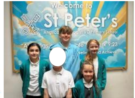
Friday 1 May