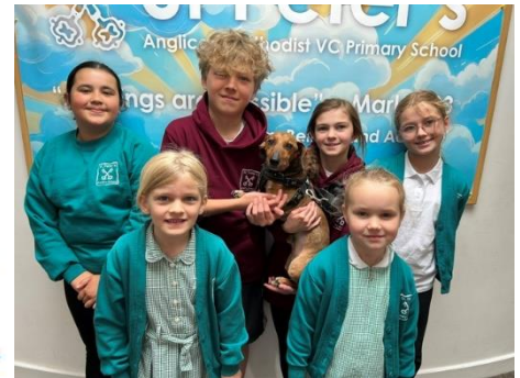
Friday 15 May