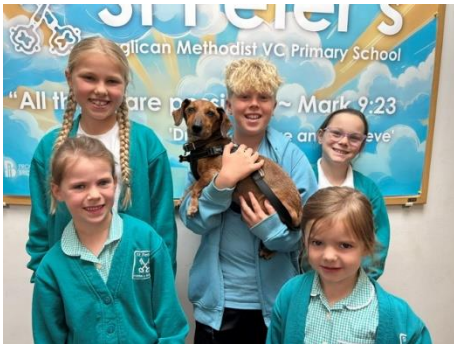
Friday 8 May

Congratulations to these children who received the Star of the Week Award from their class teachers over the last weeks of term. They have been working hard and displaying the right attitudes and values of the school, including being Ready, Respectful and Safe. You can also find their picture on the school's website.