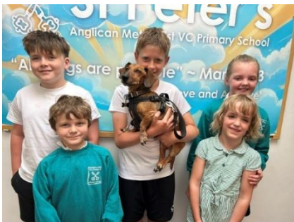
Friday 5 June

Congratulations to these children who received the Star of the Week Award from their class teachers over the last weeks of term. They have been working hard and displaying the right attitudes and values of the school, including being Ready, Respectful and Safe. You can also find their picture on the school's website.