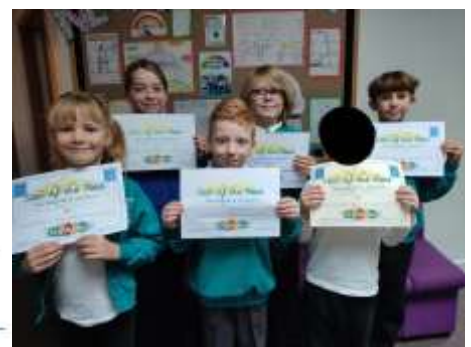
Friday 24th November