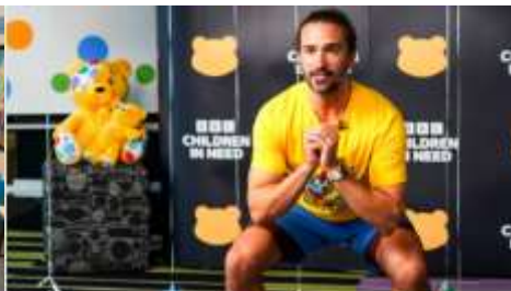
Catch up with the Pudsey Bearpees finale