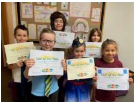
Friday 17th November

Congratulations to these children who received the Star of the Week Award from their class teachers over the last weeks of term. They have been working hard and displaying the right attitudes and values of the school, including being Ready, Respectful and Safe. You can also find their picture on the school's website.