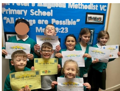
Friday 12 th January

Congratulations to these children who received the Star of the Week Award from their class teachers over the last weeks of term. They have been working hard and displaying the right attitudes and values of the school, including being Ready, Respectful and Safe. You can also find their picture on the school's website.