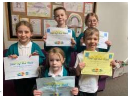
Friday 2nd February