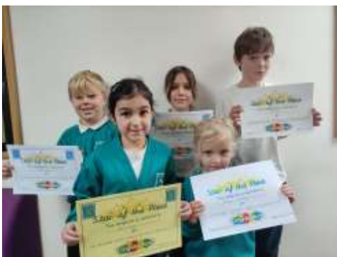
Friday 26 th January

Congratulations to these children who received the Star of the Week Award from their class teachers over the last weeks of term. They have been working hard and displaying the right attitudes and values of the school, including being Ready, Respectful and Safe. You can also find their picture on the school's website.