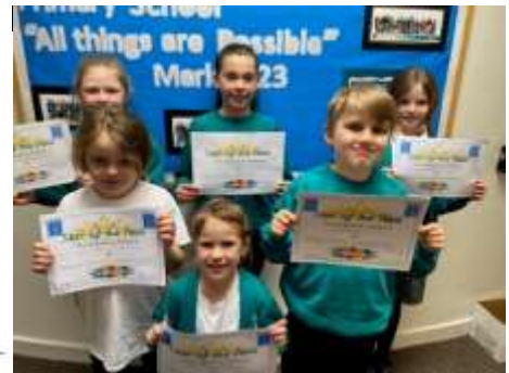
Friday 22 nd March