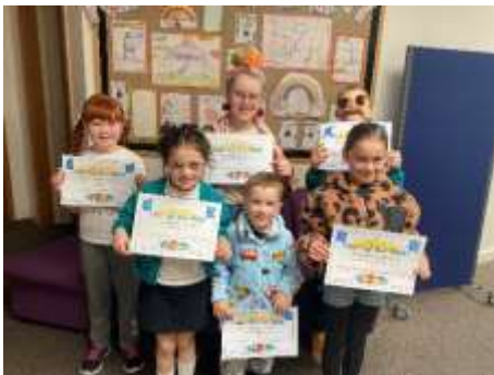
Friday 15 th March

Congratulations to these children who received the Star of the Week Award from their class teachers over the last weeks of term. They have been working hard and displaying the right attitudes and values of the school, including being Ready, Respectful and Safe. You can also find their picture on the school's website.