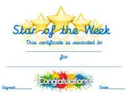
Friday 19th April