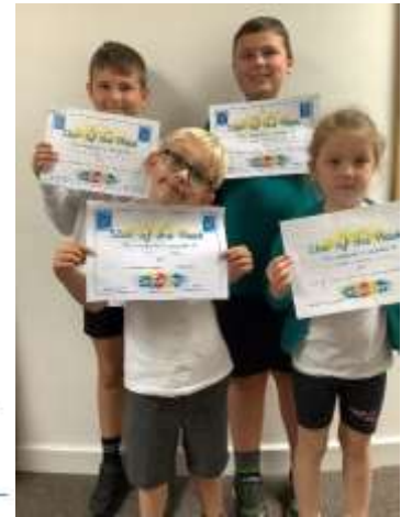
Friday 20 September