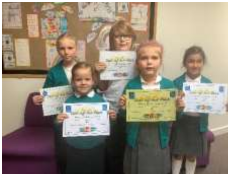
Friday 13 September

Congratulations to these children who received the Star of the Week Award from their class teachers over the first week of term. They have been working hard and displaying the right attitudes and values of the school, including being Ready, Respectful and Safe. You can also find their picture on the school's website.