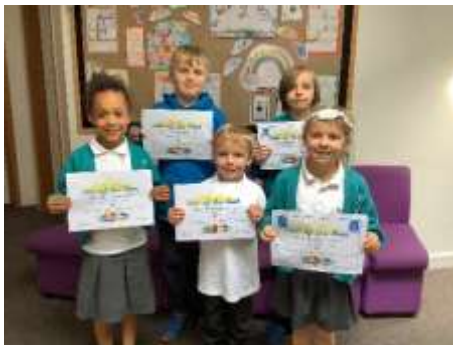
Friday 27 September

Congratulations to these children who received the Star of the Week Award from their class teachers over the first week of term. They have been working hard and displaying the right attitudes and values of the school, including being Ready, Respectful and Safe. You can also find their picture on the school's website.