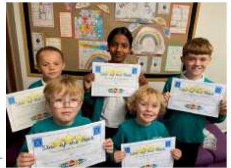
Friday 04 October