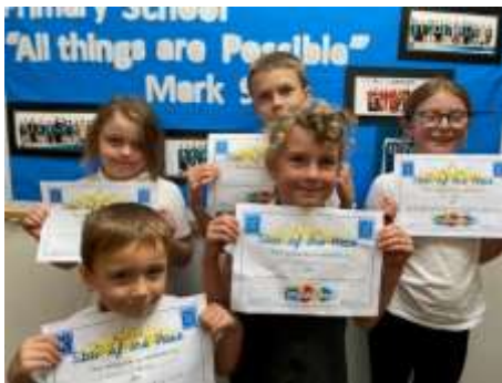
Friday 11 October

Congratulations to these children who received the Star of the Week Award from their class teachers over the first week of term. They have been working hard and displaying the right attitudes and values of the school, including being Ready, Respectful and Safe. You can also find their picture on the school's website.