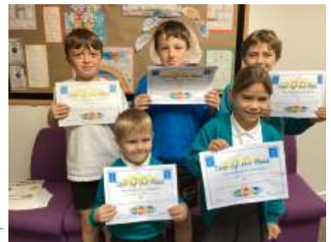
Friday 18 October