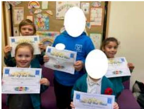
Friday 8 November

Congratulations to these children who received the Star of the Week Award from their class teachers over the first week of term. They have been working hard and displaying the right attitudes and values of the school, including being Ready, Respectful and Safe. You can also find their picture on the school's website.