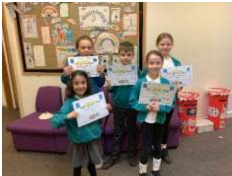
Friday 13 December

Congratulations to these children who received the Star of the Week Award from their class teachers over the last 2 weeks of term. They have been working hard and displaying the right attitudes and values of the school, including being Ready, Respectful and Safe. You can also find their picture on the school's website.