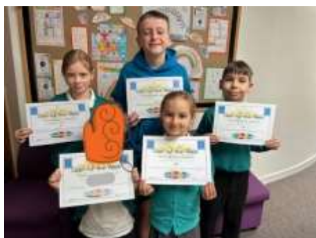
Friday 24 January

Congratulations to these children who received the Star of the Week Award from their class teachers over the last 2 weeks of term. They have been working hard and displaying the right attitudes and values of the school, including being Ready, Respectful and Safe. You can also find their picture on the school's website.