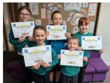
Friday 31 January