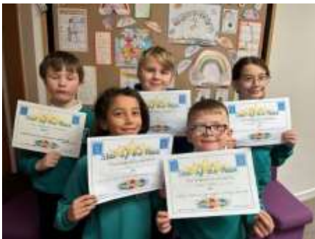
Friday 10 January

Congratulations to these children who received the Star of the Week Award from their class teachers over the last 2 weeks of term. They have been working hard and displaying the right attitudes and values of the school, including being Ready, Respectful and Safe. You can also find their picture on the school's website.