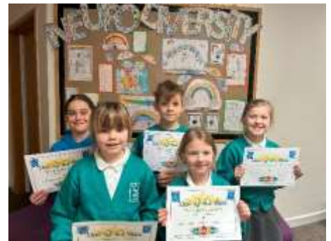
Friday 17 January