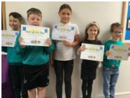
Friday 07 February

Congratulations to these children who received the Star of the Week Award from their class teachers over the last weeks of term. They have been working hard and displaying the right attitudes and values of the school, including being Ready, Respectful and Safe. You can also find their picture on the school's website.