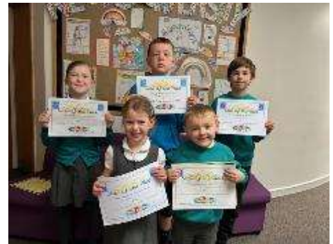
Friday 7 March