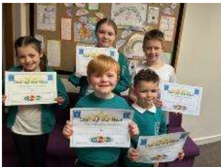
Friday 28 February

Congratulations to these children who received the Star of the Week Award from their class teachers over the last weeks of term. They have been working hard and displaying the right attitudes and values of the school, including being Ready, Respectful and Safe. You can also find their picture on the school's website.