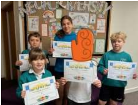
Friday 14 March

Congratulations to these children who received the Star of the Week Award from their class teachers over the last weeks of term. They have been working hard and displaying the right attitudes and values of the school, including being Ready, Respectful and Safe. You can also find their picture on the school's website.