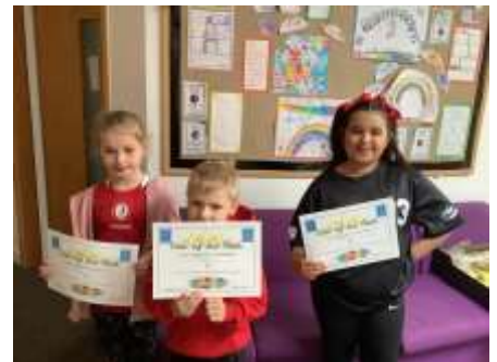
Friday 21 March