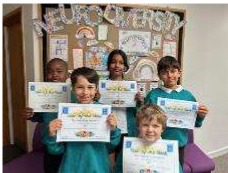
Friday 25 April

Congratulations to these children who received the Star of the Week Award from their class teachers over the last weeks of term. They have been working hard and displaying the right attitudes and values of the school, including being Ready, Respectful and Safe. You can also find their picture on the school's website.