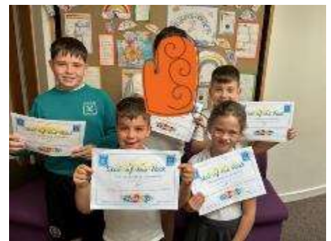
Friday 2 May