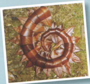
Leaves polished and greased, pinned to the ground with thorns.

Why don't you try making one next time you visit the coast?