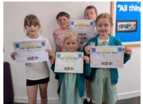
Friday 16 May