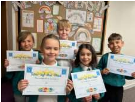
Friday 09 May

Congratulations to these children who received the Star of the Week Award from their class teachers over the last weeks of term. They have been working hard and displaying the right attitudes and values of the school, including being Ready, Respectful and Safe. You can also find their picture on the school's website.