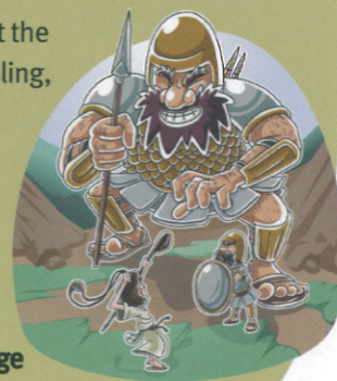
Bible story based on 1 Samuel 17

This was a day no-one would forget, when the courage of a shepherd boy saved a nation.