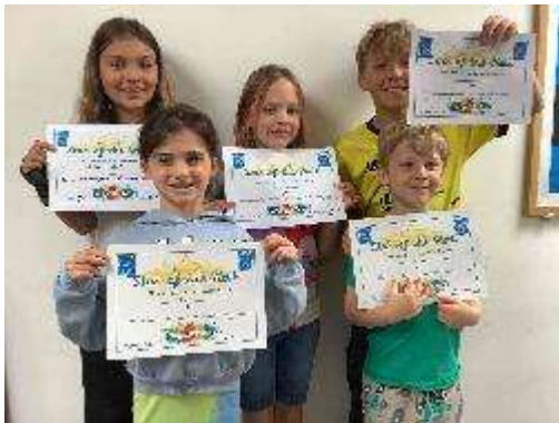
Friday 06 June

Congratulations to these children who received the Star of the Week Award from their class teachers over the last weeks of term. They have been working hard and displaying the right attitudes and values of the school, including being Ready, Respectful and Safe. You can also find their picture on the school's website.