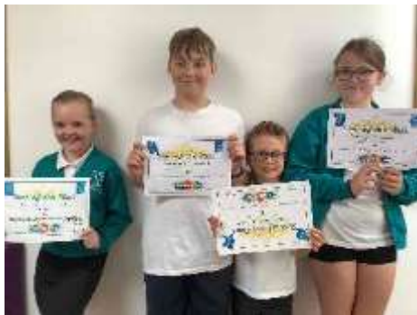
Friday 13 June

Congratulations to these children who received the Star of the Week Award from their class teachers over the last weeks of term. They have been working hard and displaying the right attitudes and values of the school, including being Ready, Respectful and Safe. You can also find their picture on the school's website.