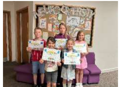
Friday 20 June