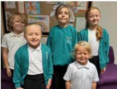
Friday 12 September

Congratulations to these children who received the Star of the Week Award from their class teachers over the first weeks of term. They have been working hard and displaying the right attitudes and values of the school, including being Ready, Respectful and Safe. You can also find their picture on the school's website.