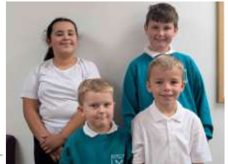
Friday 19 September