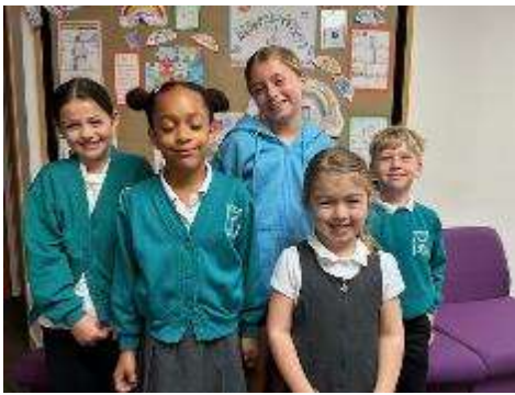
Friday 26 September

Congratulations to these children who received the Star of the Week Award from their class teachers over the first weeks of term. They have been working hard and displaying the right attitudes and values of the school, including being Ready, Respectful and Safe. You can also find their picture on the school's website.