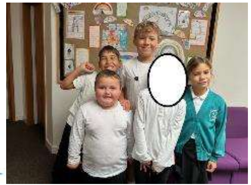
Friday 03 October