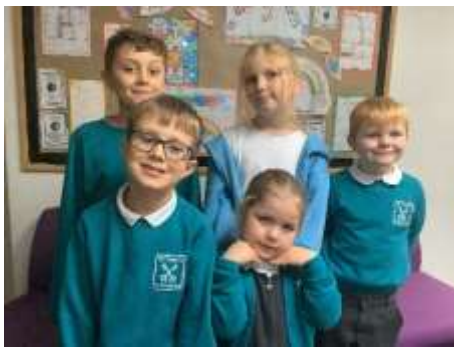
Friday 7 November

Congratulations to these children who received the Star of the Week Award from their class teachers over the first weeks of term. They have been working hard and displaying the right attitudes and values of the school, including being Ready, Respectful and Safe. You can also find their picture on the school's website.