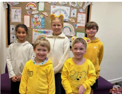
Friday 14 November

Congratulations to these children who received the Star of the Week Award from their class teachers over the first weeks of term. They have been working hard and displaying the right attitudes and values of the school, including being Ready, Respectful and Safe. You can also find their picture on the school's website.