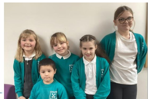
Friday 21 November