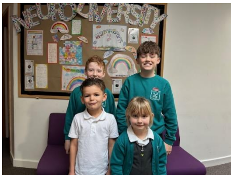
Friday 28 November

Congratulations to these children who received the Star of the Week Award from their class teachers over the first weeks of term. They have been working hard and displaying the right attitudes and values of the school, including being Ready, Respectful and Safe. You can also find their picture on the school's website.