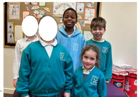
Friday 5 December