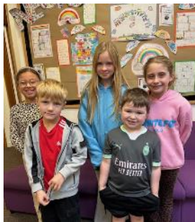
Friday 12 December

Congratulations to these children who received the Star of the Week Award from their class teachers over the first weeks of term. They have been working hard and displaying the right attitudes and values of the school, including being Ready, Respectful and Safe. You can also find their picture on the school's website.