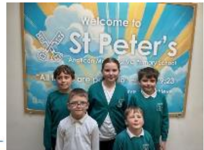
Friday 16 January