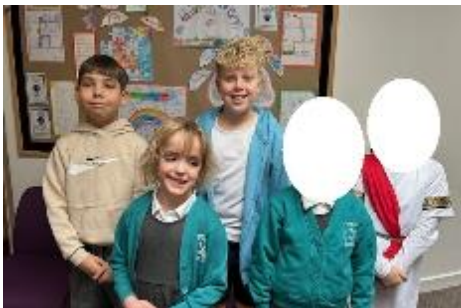
Friday 9 January

Congratulations to these children who received the Star of the Week Award from their class teachers over the first weeks of term. They have been working hard and displaying the right attitudes and values of the school, including being Ready, Respectful and Safe. You can also find their picture on the school's website.